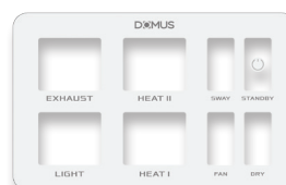
Horizontal Switchplate Film Cover (Included)