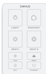
White Wall Controller (Included)

163mm Height - Minimum 200mm height clearance required