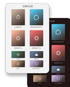
Coloured Vertical Switchplate Film Covers (Sold Separately)