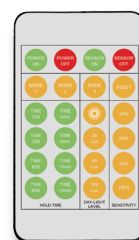
PECELL Remote Control