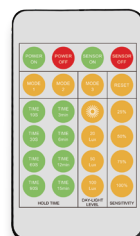
PECELL Remote Control PIR Remote Control