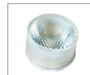
60° Lens (Optional) Variant: 10171