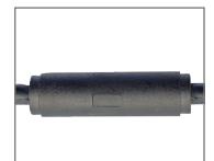
Water Stop Cable Joint