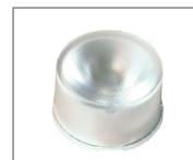
19° Lens (Optional) Variant: 10169