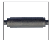
Water Stop Cable Joint