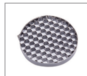
Honeycomb (Optional) Variant: 10173