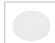
Opal Diffuser (Optional) Variant: 10267