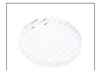
Linear Lens (Optional) Variant: 10268