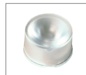
19° Lens (Optional) Variant: 10272