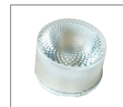
60° Lens (Optional) Variant: 10274