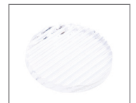
Linear Lens (Optional) Variant: 10268