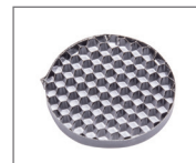
Honeycomb (Optional) Variant: 10269