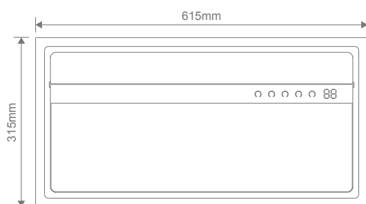
163mm Height - Minimum 200mm height clearance required